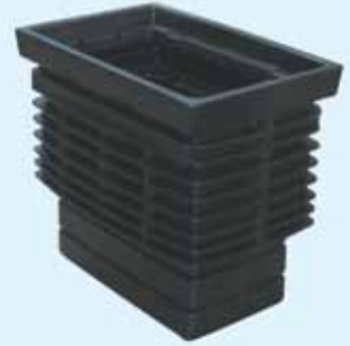
UG2005 - P5 Pit