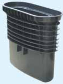
VP0152 - P2 Pit (Injection)