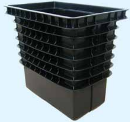
VP0158 - P5 Pit (Injection)