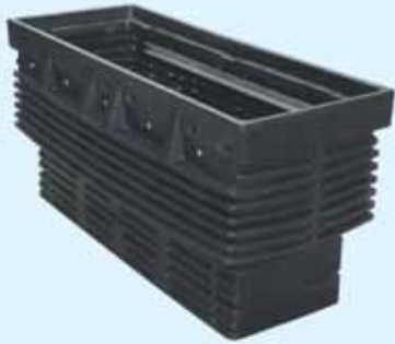
UG2006 - P6 Pit