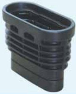
UG2001 - P1 Pit

Viscount offer a comprehensive range of polymer pits designed for use in a range of cabling and telecommunications applications. Viscount pits provide a unique side wall design that offers the necessary structural integrity to withstand the loads applied by the compaction of the surrounding soil while still supporting the vertical loads required in general use. The pits come in a range of standard sizes and are made from black UV stabilised polyethylene. The built-in cutting guides on all the pits ensure fast transformations of the pit height when installers require a reduction in the depth of the pit or for general installment. Viscount pits have been designed, developed and approved in conjunction with the major Australian Authorities in Telecommunications and Energy supply.