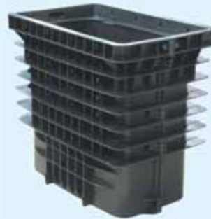
VP0155 - P5 Split Pit (Injection)