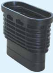
UG2002 - P2 Pit