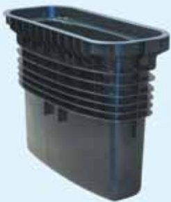
VP0153 - P3 Pit (Injection)