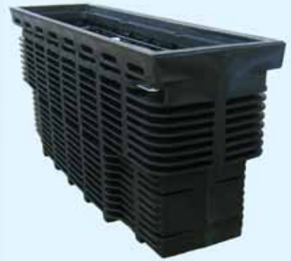
UG2900 - P9 Pit