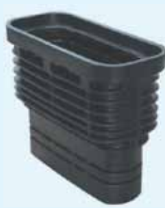
UG2003 - P3 Pit