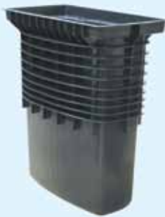
VP0154 - P4 Pit (Injection)