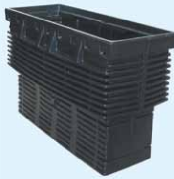
UG2008 - P8 Pit