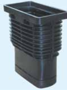
UG2004 - P4 Pit