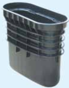
VP0151 - P1 Pit (Injection)