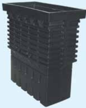
UG2007 - P7 Pit